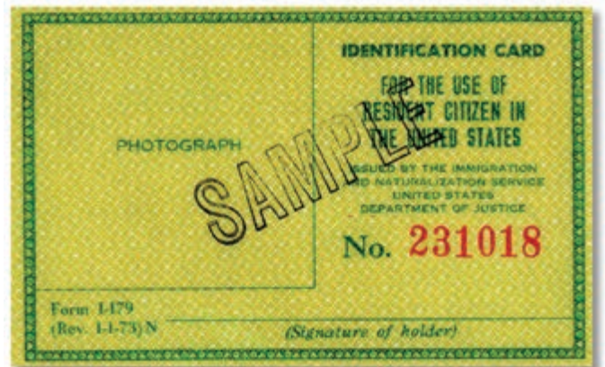
Identification Card for Use of Resident Citizen in the United States (Form I-179)

Form I-179 was issued by INS to U.S. citizens who are residents of the United States. Although this card is no longer issued, it is valid indefinitely.