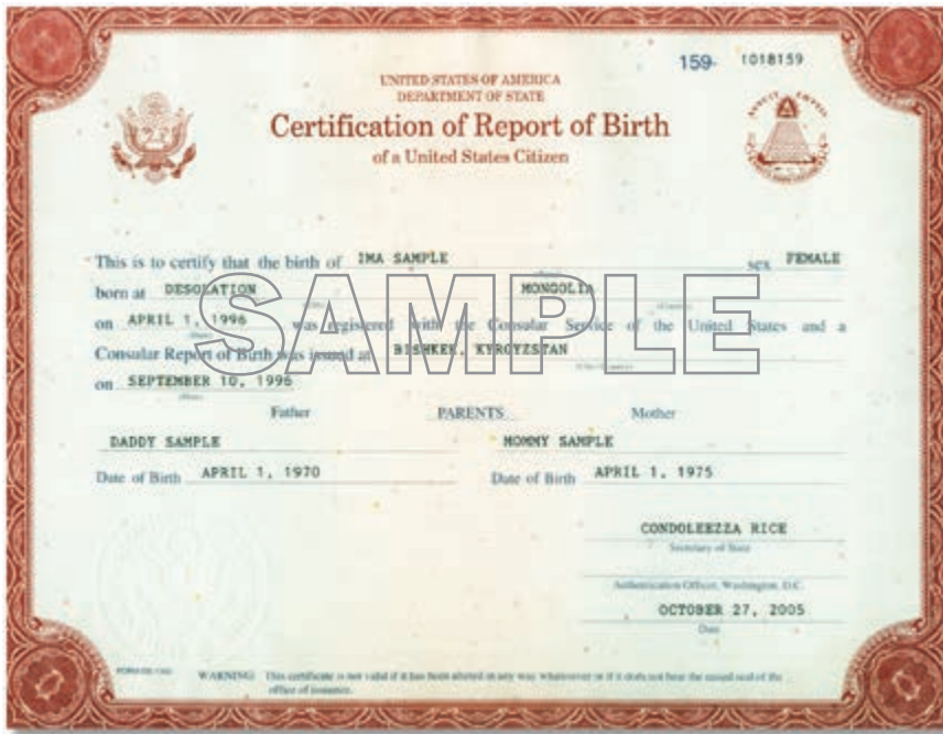
Certification of Report of Birth Issued by the U.S. Department of State (DS-1350)