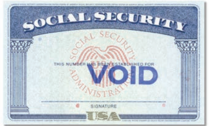
U.S. Social Security Card

The U.S. Social Security account number card is issued by the Social Security Administration (older versions were issued by the U.S. Department of Health and Human Services), and can be presented as a List C document unless the card specifies that it does not authorize employment in the United States. Metal or plastic reproductions are not acceptable.