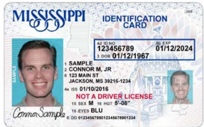
Identification card from Mississippi

Some states may place restrictive notations on their ID cards. For Form I-9 purposes, these cards may be acceptable.