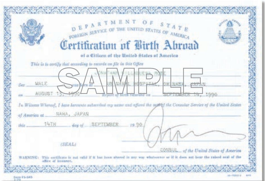
Certification of Birth Abroad Issued by the U.S. Department of State (FS-545)

These documents may vary in color and paper used. All will include a raised seal of the office that issued the document, and may contain a watermark and raised printing.